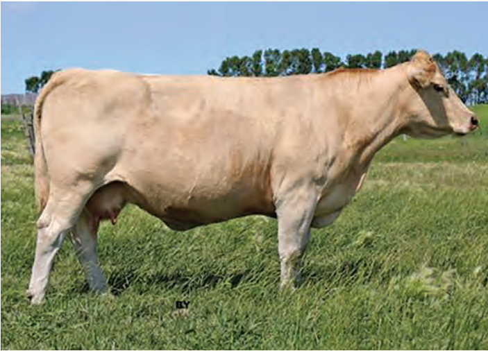
Donor dam of lots 4a-4d