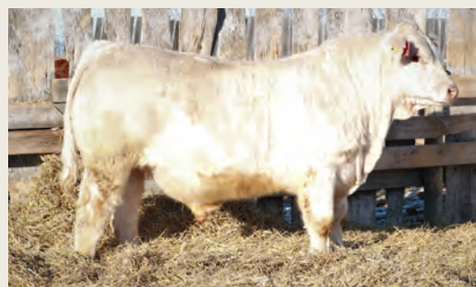
Working at Beery Ranch (MT)