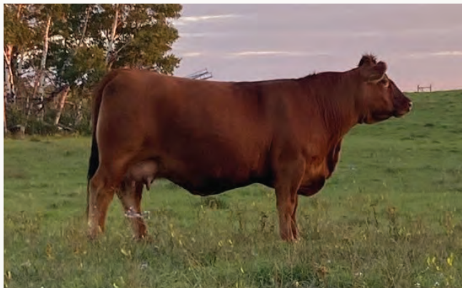
NMF 394A - dam of lot 15

PRO-CHAR CPTN. MORGAN 8U TRI-N BUFFY 79T VAL-END APPRAISER 24J CHARHEAD MISS 23R PLEASANT DAWN VOLCANO 3T KCH REDNECK GIRL 57R TRI-N-PAYDAY 419P TRI-N PRARIE ROSE 124T