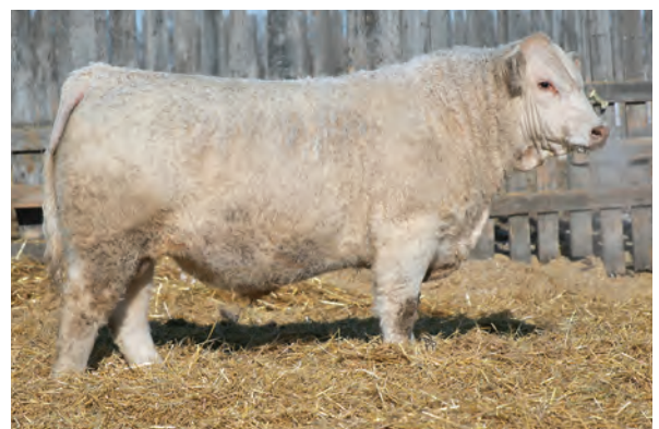
2020 HIGH SELLER TO PALMER CHAROLAIS, SK AND BOB CHAROLAIS, AB