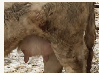
Dam of JEHU at 10 years old