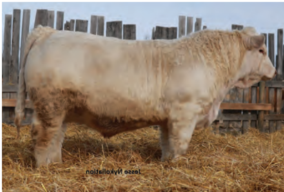
2018 HIGH SELLER TO BRASHER CHAROLAIS, UT & DENNIS CHAROLAIS, TX