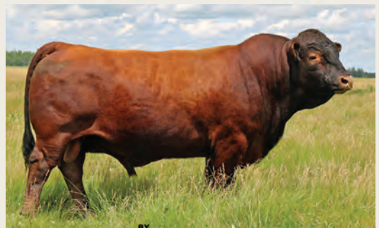
Working at TRI-N and Doll Charolais (ND)

The cow family is responsible for TRI-N Captain Morgan 340A that you will find in virtually all our red pedigrees. It started with TRI-N Buffy 79T who is still producing today and is running with the big herd of cows at 14. Every bull that cow has had, has made the bull sale and sold. Several are working in purebred herds such as Wilgenbush Charolais (SK), Nielson Bros (MO), Doll Charolais (ND) and TRI-N. Her son last year was our lead off dark red bull selling to DUCHSHERER Grain and Livestock (ND). This cow family will put punch in your genetics with unparalleled capacity.