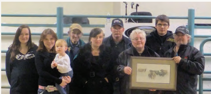
"Beaver Creek Charolais at their dispersal 2013."

In 2015, TRI-N Charolais created their own bull sale at Heartland Livestock in Virden. In 2018, the bull sale was moved to the farm at Lenore, MB where it remains today.