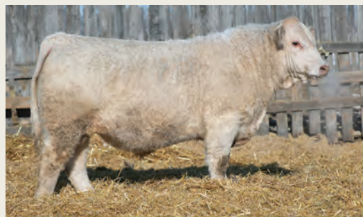
GO North 2411H - Working at Palmer (SK) and Bob (AB)