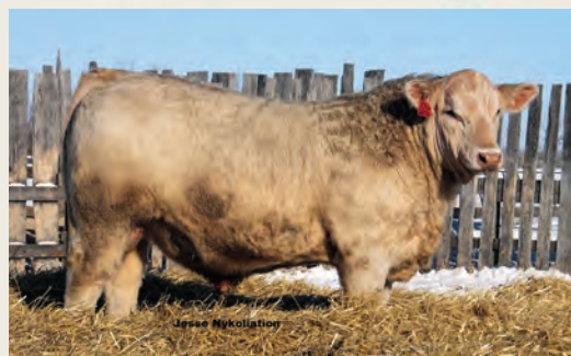
Working at Triple C Charolais

Very closely related to the Prairie Rose cow family and I consider these females as part of it. Both trace back to TRI-N Cream of the Crop 27H (Jesse's first 4-H heifer), a gold star dam who produced until 14. This cow family was named after TRI-N Creamsicle 85T which produced TRI-N Thriller 176Z which was the sire of SCX Thriller 89B that sired some of the nicest females in the offering. A whole life's work to breed this cow family.