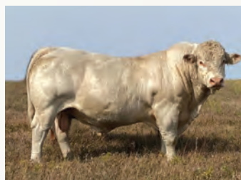
SCX JEHU 233E as a two year old

Selling 100% interest, full possession. TRI-N reserves the right to the use of in herd semen only.