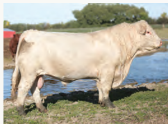
Hammertime 5148E - son of lot 2