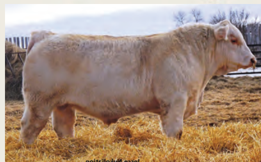
Working at Vikse Farm (AB)

This cow's genetics were the base of the high selling Charolais bull in Canada in 2012 (TRI-N Prefix 54Y) and the Manitoba record high seller TRI-N Go North 2411H.