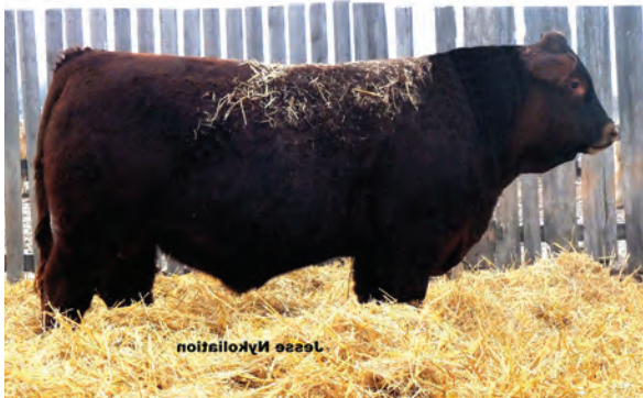
2016 HIGH SELLER TO SPRUCE VIEW CHAROLAIS, AB