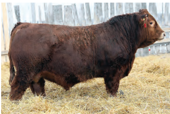
2020 HIGH SELLER TO CLIFF LEE ENTERPRISES, MO AND THE STREVELER GROUP