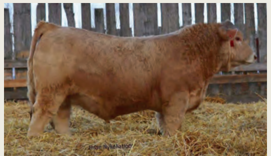
Jesse Nykall Working at TRI-N