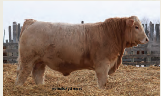
Working at Graf Charolais (ND)