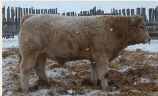
Working at HB Cattle (Utah)

An extremely productive cow family that's outcross to most genetics with lots of French influence in the back of the pedigree. This cow family includes TRI-N Miss Charhead 917W which is one of the most picturesque females you will find on the ranch. She is the dam of our mainstay TRI-N Red Baron 765E whose sons have been topping our bull sales the past few years. Excellent udders, heaps of hair. Premium cow family.