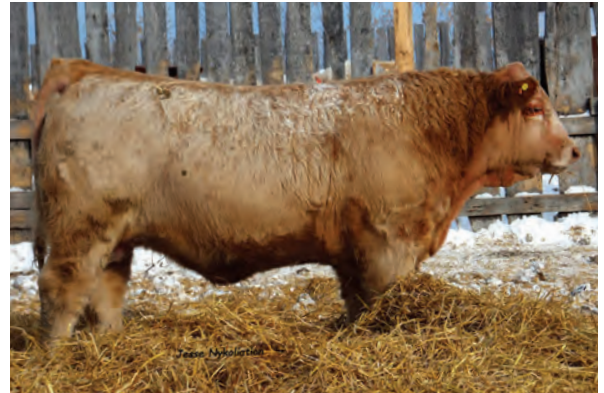
2015 HIGH SELLER TO R+G MACDONALD LIVESTOCK, MB