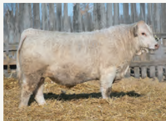
Go North 2411H - son of lot 2