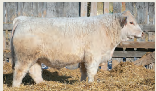
Working at Lynn Cattle Co. (SK)