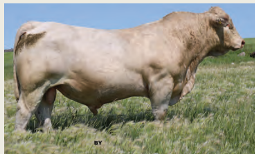
Working at TRI-N Charolais