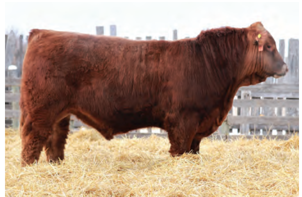
2019 HIGH SELLER TO CLIFF LEE ENTERPRISES, MO