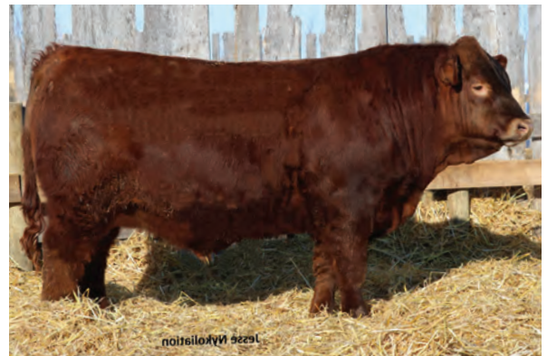
2017 HIGH SELLER TO CIRCLE 5 RANCH, ND