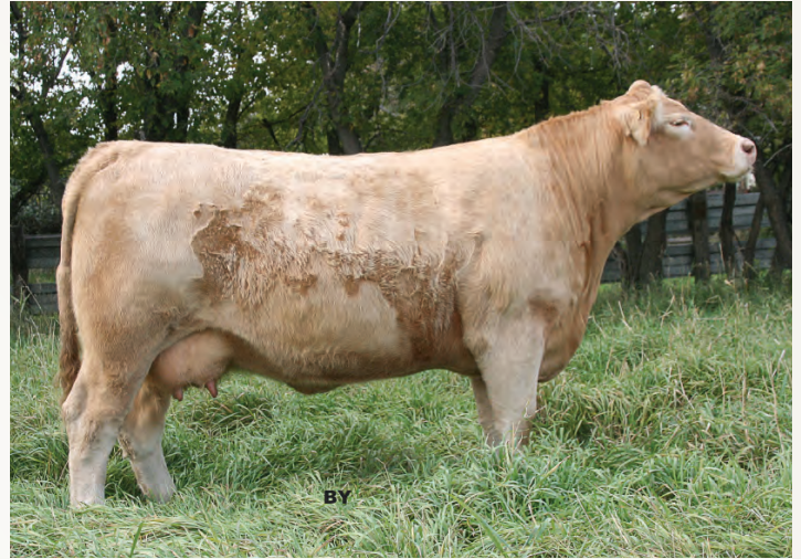
Full Sibling to lots 4a-4d