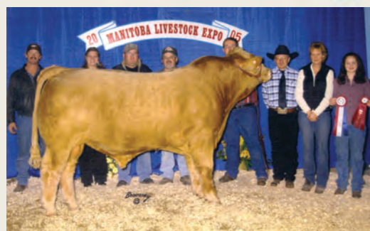
Working at TRI-N

TRI-N Reba 93T a maternal sister to Payday has been sent to Texas A+M University to highlight their embryo program at 14 which you will find there is a heavy influence here. She produced one of the nicest SCX Thriller sons we have raised, Dr. Merv, selling to Beery Ranch (MT). If I was building a herd of cows, I'd purchase a few of these Reba females.