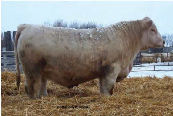
2014 HIGH SELLER TO CLEVELAND CHAROLAIS, SD

WATCH FOR BULLS LIKE THIS IN OUR 7TH ANNUAL TRI-N CHAROLAIS BULL SALE - MARCH 21 - ON THE FARM - LENORE MB!!