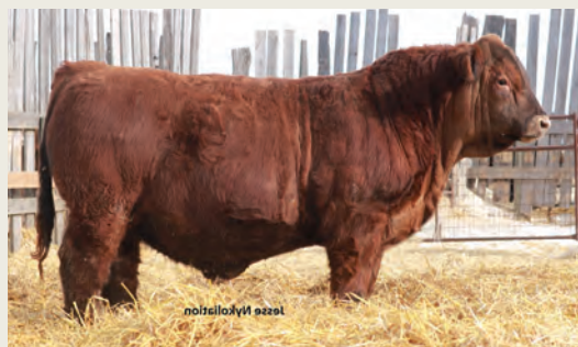
Working at Rockin X5 (ND)