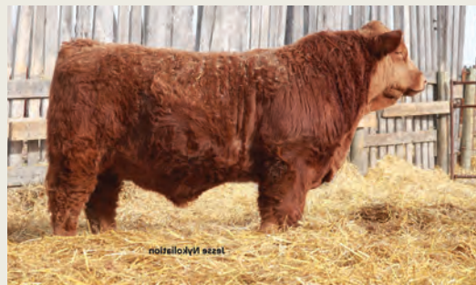
Working at TRI-N