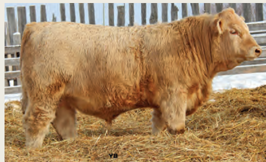
Working at Triple C Charolais (MB)