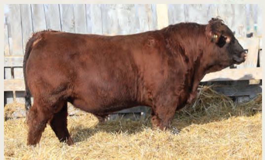
Working at TRI-N

This cow family was named after TRI-N Rationelle 26R, a Gold Star Dam that produced a calf every year until she was 14. Her daughter, 97T was an excellent cow as well producing until 12 and was a Gold Star Dam. This cow family can be found in our newest feature red factor sire Jacks Foundation 7F.