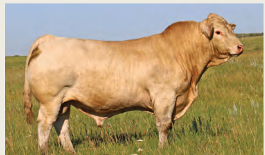
Working at Wilgenbush Charolais (SK)