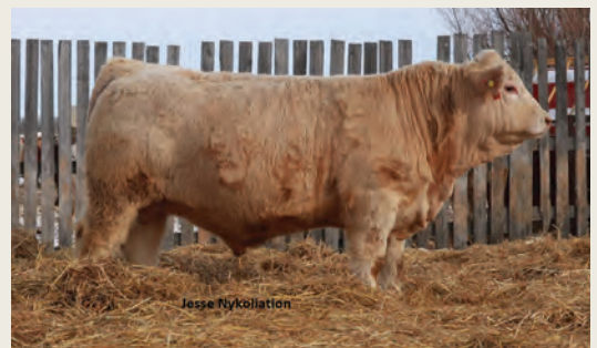
Working at Walters Charolais (ND)